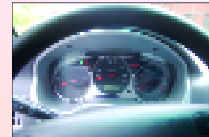
Elegant dashboard provides a clear view with easy access to vital information whilst driving.