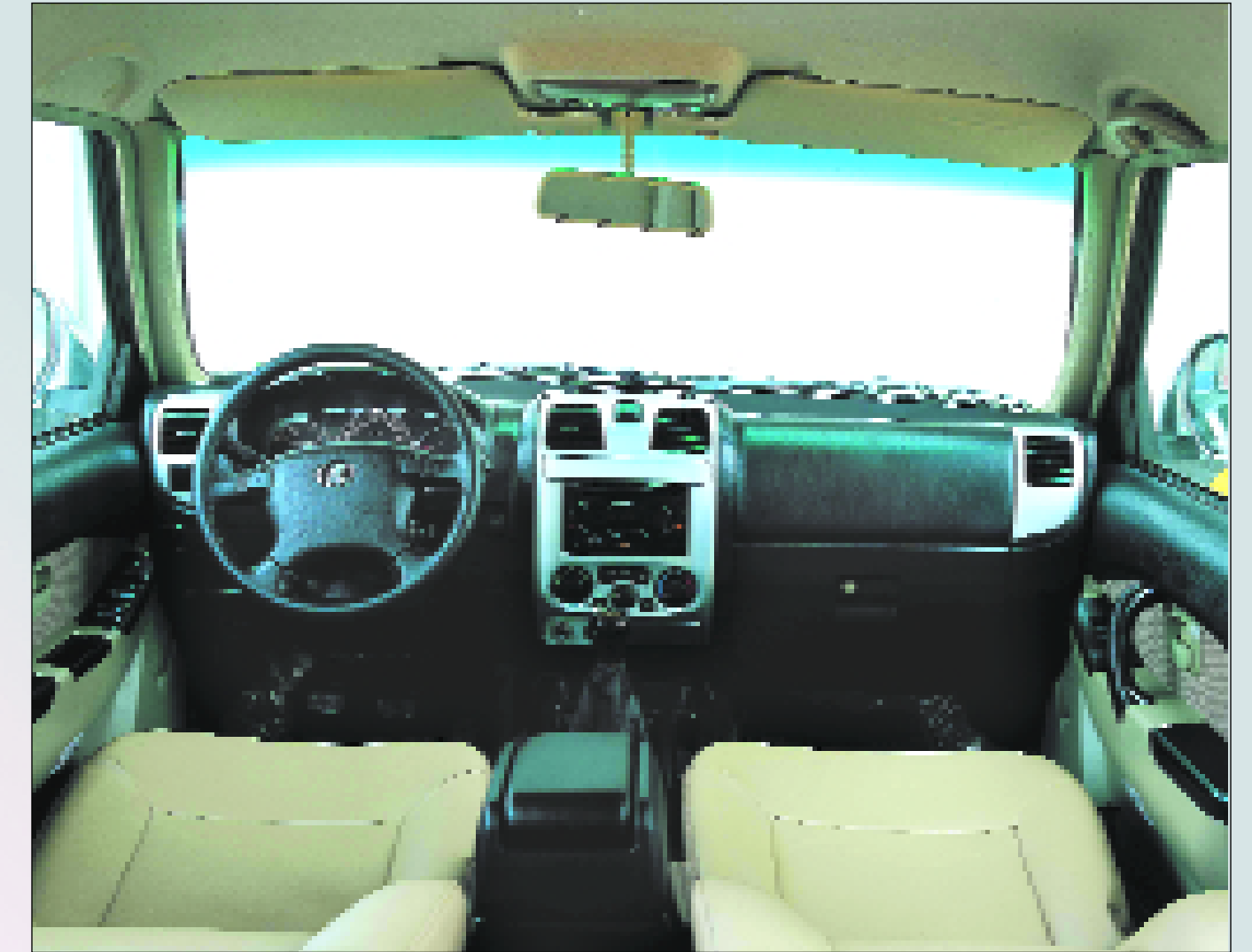
Spacious cabin accommodates seven passengers comfortably.

The interior has been created to provide adequate space to cover every situation. The side seats located in the boot fold outwards and the rear seats can be folded forward to provide additional space for carrying abnormal loads.