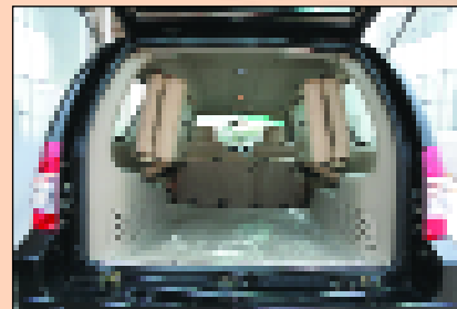
The luggage compartment is very spacious, especially if you fold down the rear side seats.