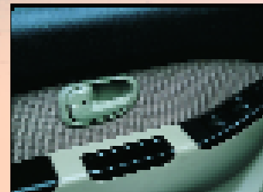
Electrically operated windows and side mirrors.